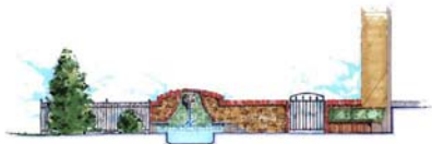
ELEVATION SECTION A